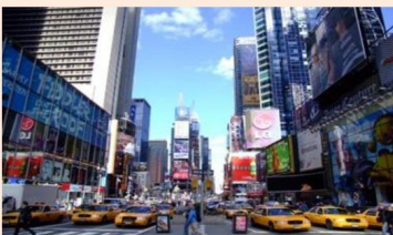
Explore New York!