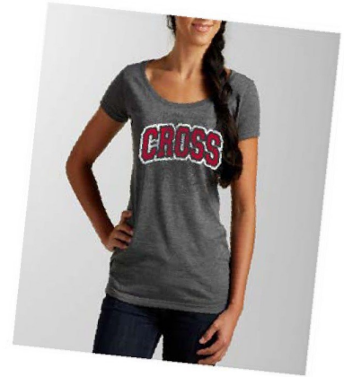
Cross Distressed Ladies Scoop Neck $15.00 Adult Sizes S, M, L, XL, 2X Add $2.00 for 2X