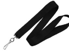
Cross Lanyard $4.00