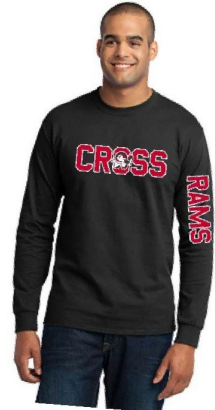
Rams Long Sleeve 50/50 T $22.00 Adult Sizes S, M, L, XL, 2X, 3X Youth Sizes M, L Add $2.00 for 2X. Add $3.00 for 3X.