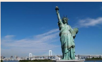
See the Statue of Liberty!