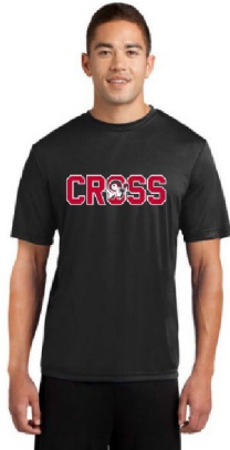
Rams Sport Wick T $15.00 Adult Sizes S, M, L, XL, 2X, 3X Youth Sizes M, L Add $2.00 for 2X. Add $3.00 for 3X.