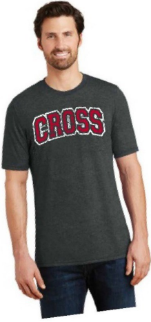
Cross Distressed T $10.00 Adult Sizes S, M, L, XL, 2X, 3X Youth Sizes M, L Add $2.00 for 2X. Add $3.00 for 3X.