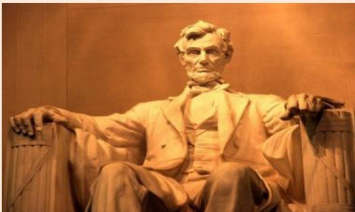
Visit the Memorials!