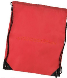
Cross Cinch Sack $8.00 Black or Red (while supplies last)