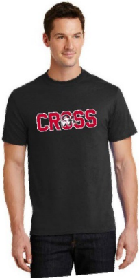
Rams Soft Spun T $10.00 Adult Sizes S, M, L, XL, 2X, 3X Youth Sizes M, L Add $2.00 for 2X. Add $3.00 for 3X.