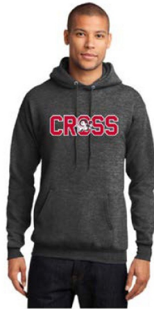
Rams Pullover Hood $25.00 Adult Sizes S, M, L, XL, 2X, 3X Youth Sizes M, L Add $2.00 for 2X. Add $3.00 for 3X.